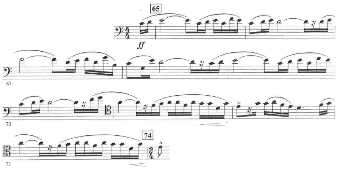
Brahms, Ein deutsches Requiem, Op. 45: VI. [Vivace: Quarter=148]